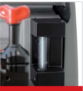
Electronic Optical Reader