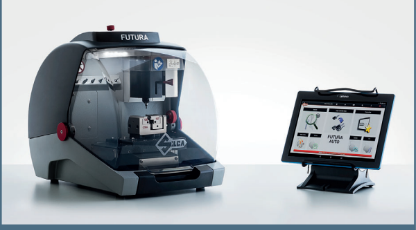
The patented tablet holder can be tilted and can be attached on top of the machine or can be placed on the work bench next to the machine

Futura Auto is controlled by a 10" touch-screen tablet that guides you step-by-step through the entire key duplication process. The software tells you what Silca reference you should use with a simple research by make, model and year of the vehicle, and indicates in what side of the clamp you should put the key or